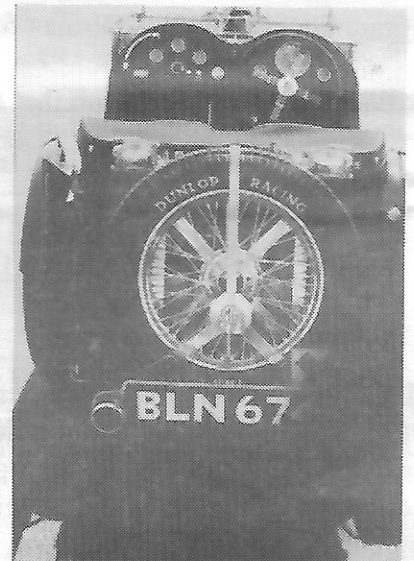
The Rare L Type MG in perfect shape built in the 1930's.