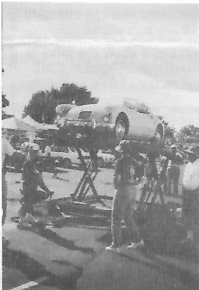
Safety Fast Inspections!! Just one of the fun things to do with your car at Indy'96.