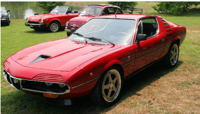
A couple of other also-rans: