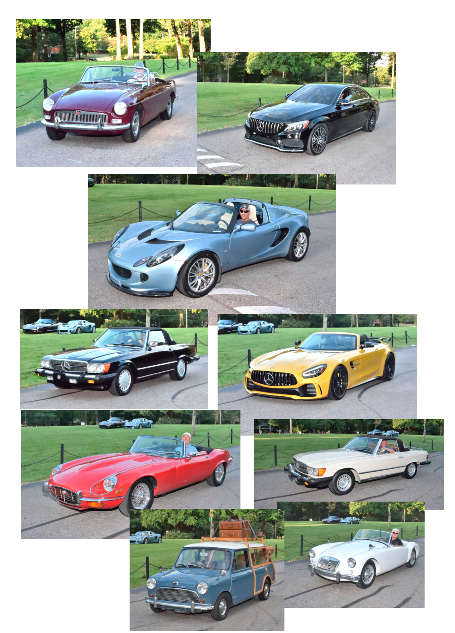
Look at the happy Golden Retriever!